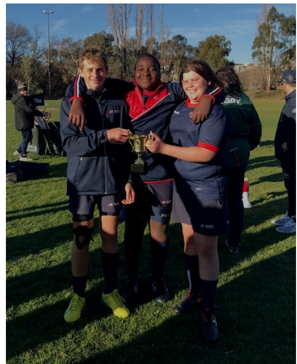
Old Collegians members of Under 14's Team with the Cup

Thank you to ACT & SNSW Club Rugby and Rugby Australia for hosting the Championships.