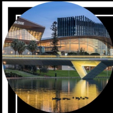
ADELAIDE CONVENTION CENTRE PANORAMA BALLROOM