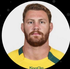
SCOTT HIGGINBOTHAM FORMER WALLABY PLAYER AND SUPER RUGBY WINNER

TICKETS $150 | TABLES OF 10 | 3 COURSE MEAL SELECTED BEER, WINE AND SOFT DRINK INCLUDED | CHUNKY CUSTARD