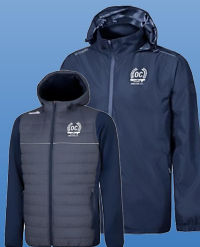
Dalton Jacket $80 adults Harrison Jacket $97 adults