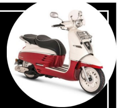
WIN THIS 2022 PEUGEOT DJANGO ON THE NIGHT THROUGH OUR KEY RAFFLE