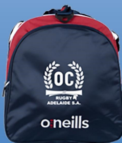
Bag from $49