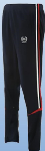
Trackpants $50 kids $55 adults