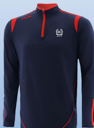
HZ Brushed Top $60 kids $70 adults