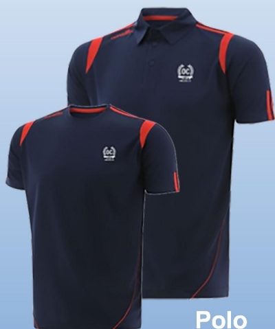
T-Shirt $35 kids $40 adults Polo $44 kids $47 adults