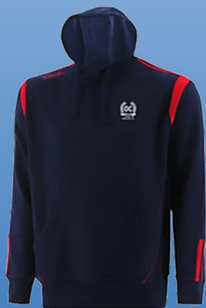
Hoodie $55 kids, $65 adults